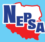
Northeastern Polish Student Alliance 2003