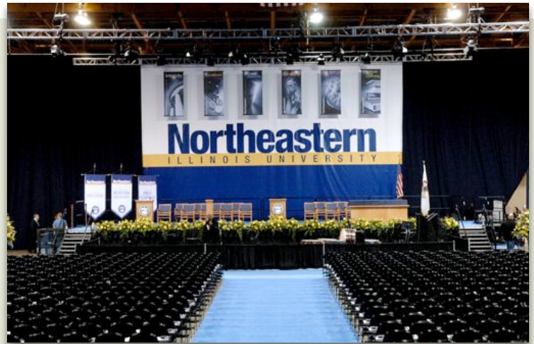
Images from NEIU's Fall 2011 Commencement, held at the University of Illinois-Chicago Pavilion. Congratulations to all CMT graduates!