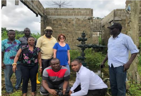
Oil Well #1