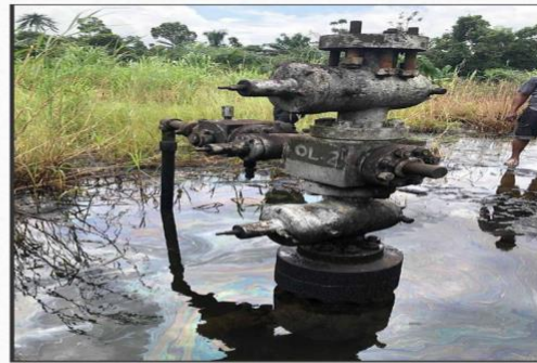
Picture Taken July 2019: Decommissioned and abandoned by Shell, but still leaking oil

(Left) Isidore Udoh (in red) with colleagues and community groups during assessment of leaking (decommissioned) oil wells in the Niger Delta; (Right) A supposedly decommissioned oil well that is continuing to spill oil into the rainforest environment