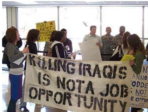
An NEIU student protest in 2007