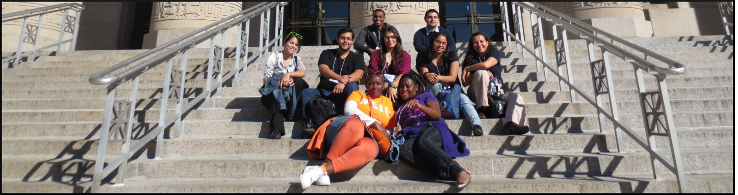
Scholars on the steps of University of Michigan

This summer, McNair Scholars visited Loyola University Chicago, University of Michigan, University of Chicago, University of Illinois at Chicago, and DePaul University. The purpose of these visits was to introduce Scholars to faculty and provide insight regarding the application process at each institution as well as to demonstrate the robust program set offered by each institution.