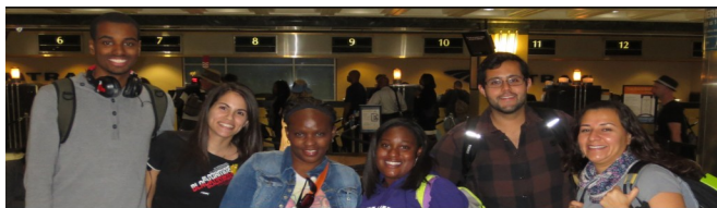
Scholars En Route to Conference

Scholars attended The National McNair Research Conference in November at the Grand Geneva Resort of Wisconsin. The conference, organized by the University of Wisconsin, was designed to provide undergraduate students with the opportunity to explore options of graduate study. Panel discussions, workshops, and activities all introduced McNair Scholars to the nature of graduate study and provided helpful tips and suggestions to aid in their writing of effective graduate admissions applications.